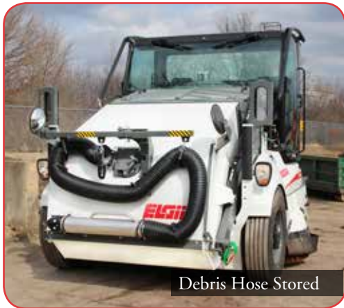
Debris Hose Stored