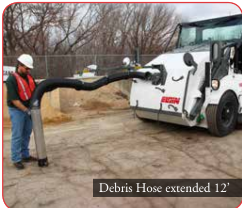
Debris Hose extended 12'