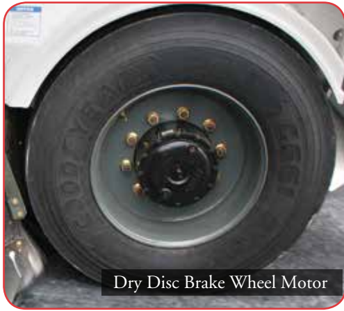
Dry Disc Brake Wheel Motor